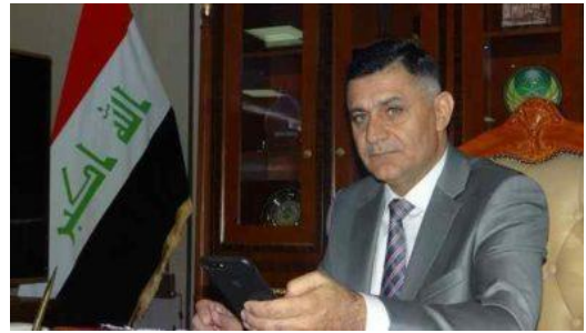
The Minister of Communication